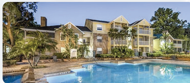
Newport Colony - Orlando, FL