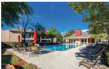
The Walnut Portfolio Dallas, TX