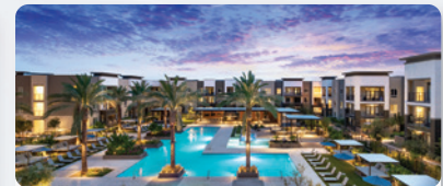
Maxwell on 66th - Phoenix, AZ