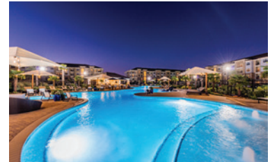
Cortland Spring Plaza Houston, TX