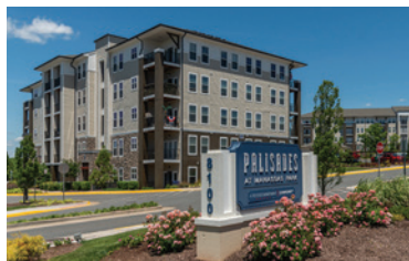
Palisades at Manassas Park Manassas Park, VA