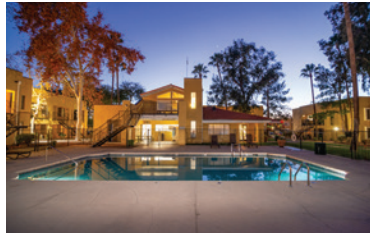
Villa Bugambilias Tucson, AZ