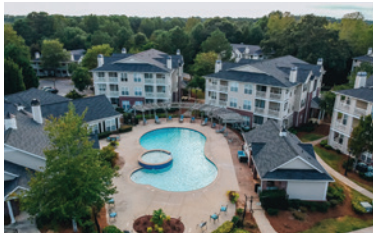
Lexington on the Green Atlanta, GA