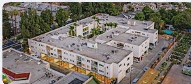
Coldwater Continental Apartments Los Angeles, CA