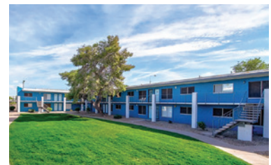
Villas de Azul Phoenix, AZ